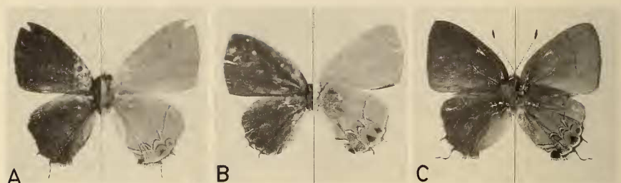
FIG. 1. Side by side comparison of upper (left) and under (right) surfaces of Gigan-tofalca calilegua holotype male (A), and Calystryma phryne holotype male (B) and recently collected female (C), same data as C. calilegua holotype.

not been widely recognized by biologists as Neotropical "refugia" or "centers of endemism."